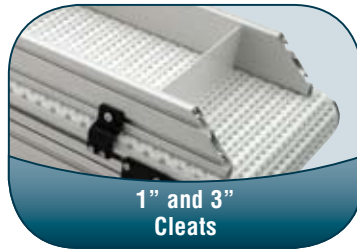
1" and 3" Cleats