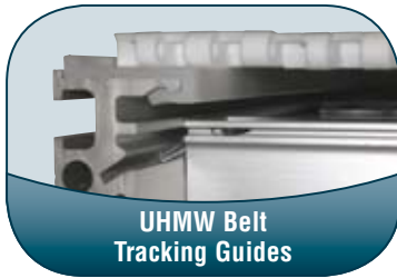
UHMW Belt Tracking Guides