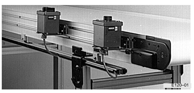
Figure 1: Wire Way Trough Kit Installed

Either Kit includes these instructions, a Wire Way Trough, T-slot Cover Strips, 2100 Series and 3100 Series Conveyor Mounting Clips, Wire Trough Mounting Brackets, a Tool and Metric Mounting Hardware to aid in Kit installation on a Dorner Conveyor.