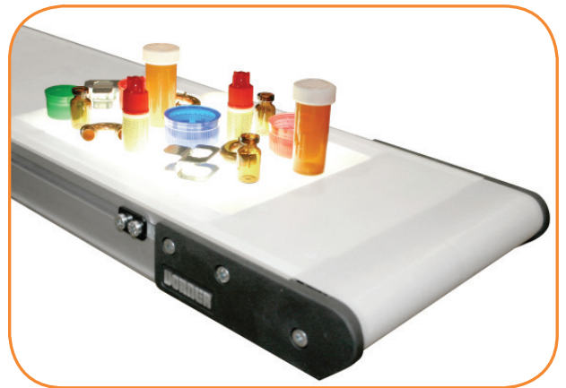
Ideal for a variety of products