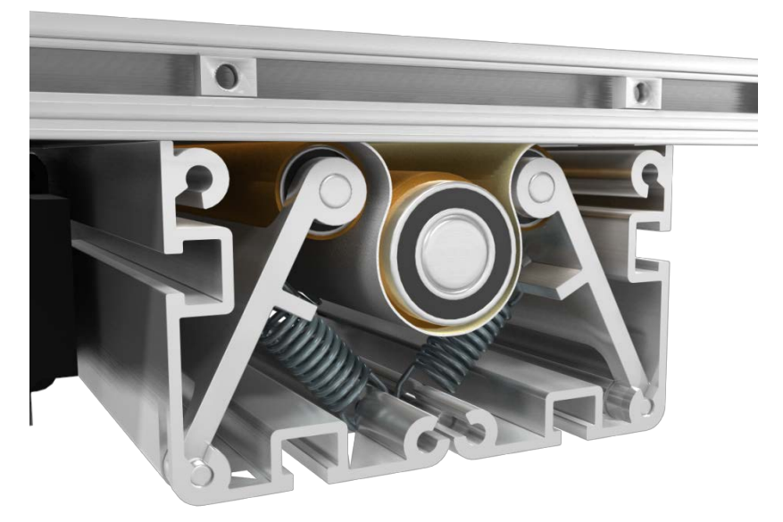
Figure 10. Pinch Drive Mechanism.

The only potential disadvantage to the pinch drive mechanism is it adds complication to the belt change process. Since the belt is now woven between two or more rollers these rollers must then be removed to change or maintain the conveyor belt. This miniature conveyor design also incorporates a patent pending two-half drive construction to aid this need. This construction, as shown in Figure 11, allows the top half of the drive module to be separated from the lower half. This is done by simply removing a few screws. With the lower half of the module, which contains the pinch rollers, removed the conveyor belt is now free to be removed from the side of the conveyor. This process is substantially quicker than is typically experienced with traditional center drive tension type conveyors.