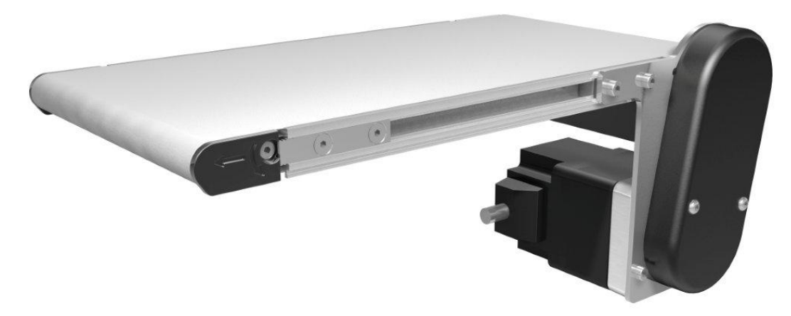
Figure 5. Miniature End Drive Conveyor.

The conveyor shown below is the result of a product development effort to solve the problems facing design engineers for pharmaceutical / medical product automation. It has two belt drive options, an End Drive option as shown in Figure 5, and a Mid Drive option shown in figure 6. The Mid Drive option removes the drive motor and mechanism from the end of the conveyor, opening it up for ease of product transfer and machine interface.