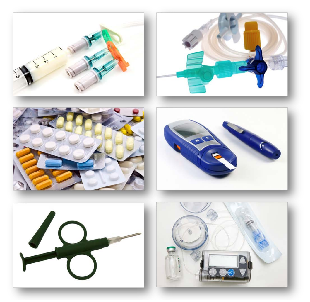
Figure 1. Typical Pharmaceutical / Medical Products.

The handling of pharmaceutical / medical products and medical product assembly has unique requirements. They are generally very small. They are often made of plastic, very light and can be fragile. Parts and assemblies of this type include vials, RV's, syringes and catheters as can be seen in Figure 1.