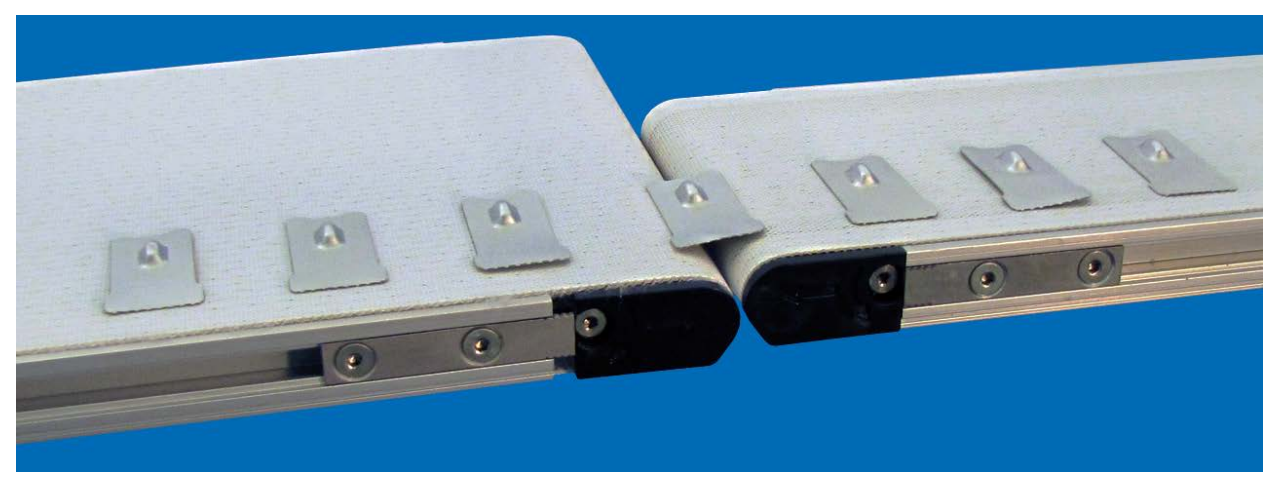
Figure 7. Miniature Conveyor End Product Transfers.

The conveyors have end rollers that are only 5/8" in diameter. When placed together, as shown in Figure 7, miniature conveyors can transfer a product as small as 7/8" in diameter. In addition, both models can be equipped with 5/16" dual end rollers. When placing these versions together a product as small as 5/8" in diameter can be transferred.