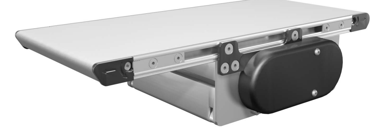
Figure 6. Miniature Mid Drive Conveyor.

The conveyors have end rollers that are only 5/8" in diameter. When placed together, as shown in Figure 7, miniature conveyors can transfer a product as small as 7/8" in diameter. In addition, both models can be equipped with 5/16" dual end rollers. When placing these versions together a product as small as 5/8" in diameter can be transferred.