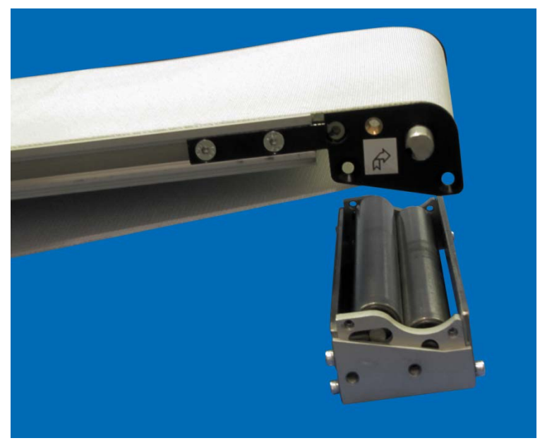
Figure 11. Belt Removal with Two-half Drive Construction.

The only potential disadvantage to the pinch drive mechanism is it adds complication to the belt change process. Since the belt is now woven between two or more rollers these rollers must then be removed to change or maintain the conveyor belt. This miniature conveyor design also incorporates a patent pending two-half drive construction to aid this need. This construction, as shown in Figure 11, allows the top half of the drive module to be separated from the lower half. This is done by simply removing a few screws. With the lower half of the module, which contains the pinch rollers, removed the conveyor belt is now free to be removed from the side of the conveyor. This process is substantially quicker than is typically experienced with traditional center drive tension type conveyors.