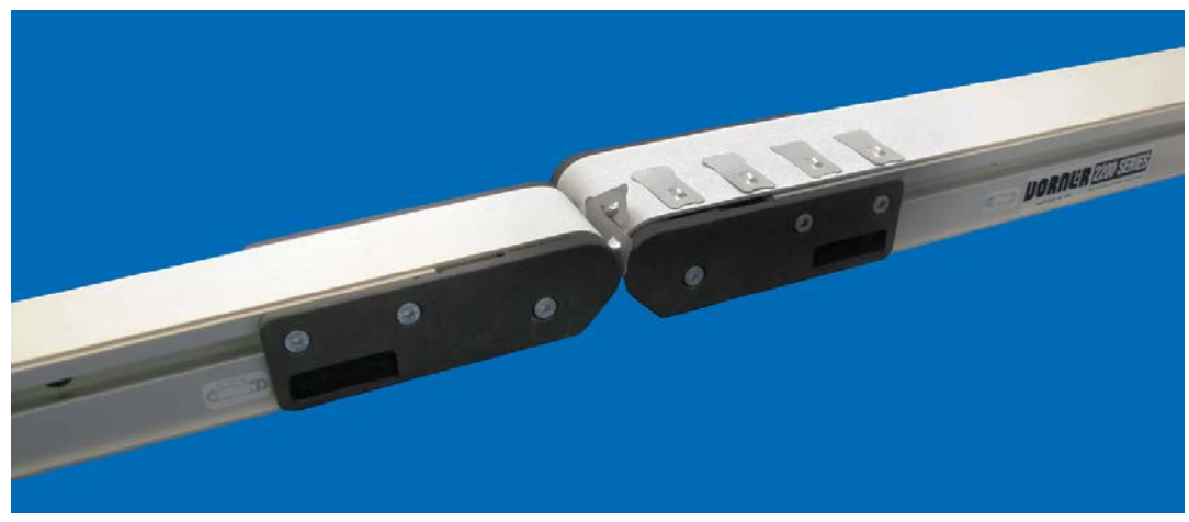
Figure 2. Small Part End Transfer.

1. <u>Part End Transfer</u>. Since the parts are so small the ability to transfer them from one conveyor to the next can be problematic. Parts are often less than 1" in size, therefore requiring a roller diameter much less than 1". Typical conveyors have rollers 1 ¼" or larger. These are simply too large to be practical as seen in Figure 2. An alternative method of transfer shown in Figure 3 is called waterfall transfers. This is accomplished by placing the roller of one conveyor over the next. While this does transfer the part it does not maintain product orientation due to the drop in height and can cause product damage from the free fall. In addition, parts like vials simply cannot use this method.