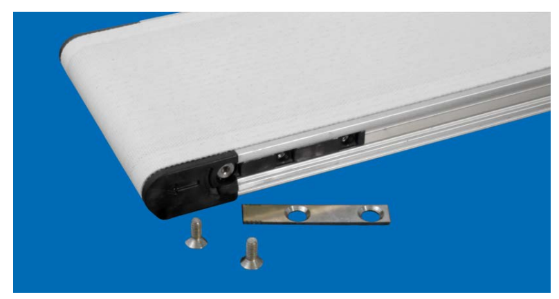
Figure 9. Stepped T-Slot.

There is one technology that is the driving force behind miniature conveyors enabling the components to be so small. This technology is the pinch drive mechanism. The pinch drive is incorporated in both the End Drive conveyor and the Mid Drive conveyor and allows the conveyor to run with almost no belt tension. Typical belt conveyors run under high tension. Tension is needed for the drive roller to have enough traction to drive the belt. However it is this tension that causes bearings and conveyor rollers to be oversized to handle the load. A miniature conveyor simply is not large enough to handle typical belt tension. The purpose of the pinch drive is to force the conveyor belt against the drive roller giving it driving traction without the use of tension. This is shown in Figure 10. The patent pending Mid Drive conveyor has two pinch rollers. Each spring loaded against the drive roller. This configuration allows the belt to be run in either direction and only requires enough belt tension to lay the conveyor belt flat. Since over-tensioning the belt is not required the belt lays flatter which is needed for light weight medical components. In addition, since the pinch drive does not need tension to drive, there is no need for belt take-up or belt stretch maintenance.