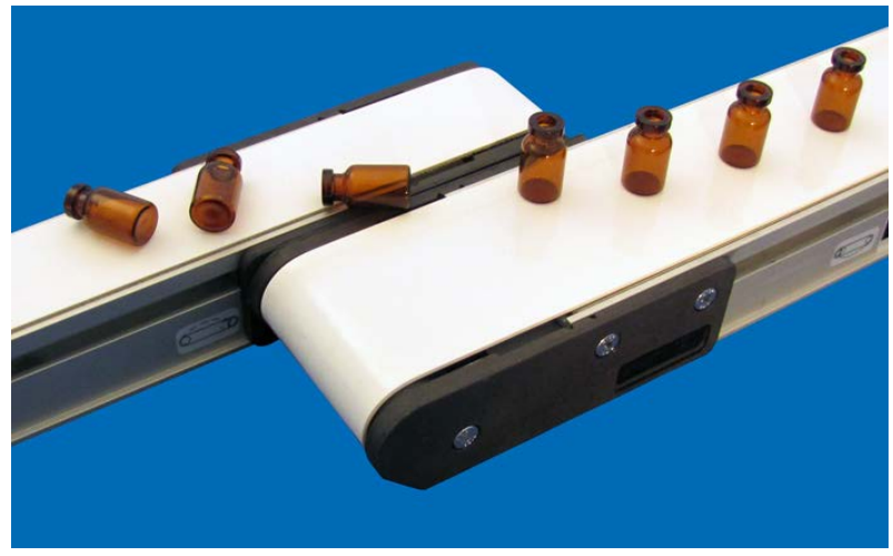
Figure 4. Small Part Side Transfer.

2. <u>Part Side Transfer</u>. If a part cannot be transferred off the end of a conveyor the alternative method is to transfer off the side. If the belt edge is close to the conveyor frame you can then transfer small parts. This is illustrated in Figure 4. However most conveyors have their bearing housings on the outside of the conveyor frame. Even if the housing is staggered and minimized to ½" or less, as is commonly done, this still does not allow for the transfer of very small parts or vials.