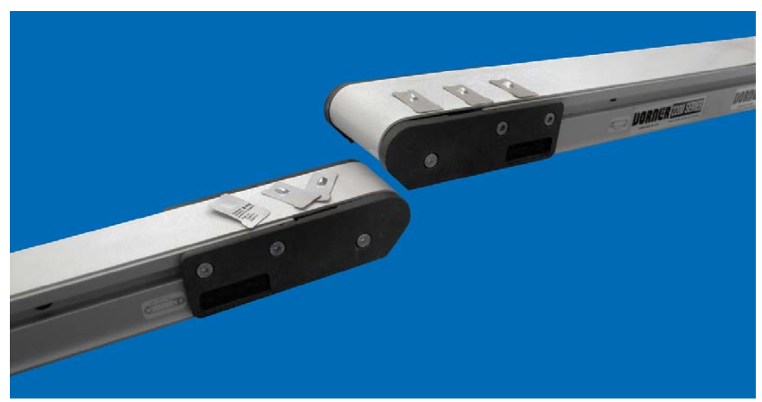
Figure 3. Small Part Waterfall Transfer.