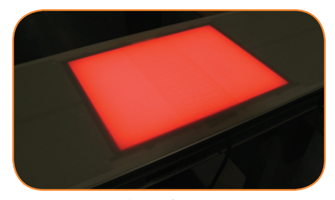
Variety of Light Colors Available