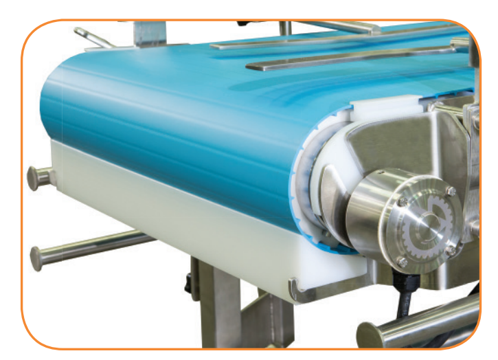
Sanitary Drive Options including Motorized Drive Pulley