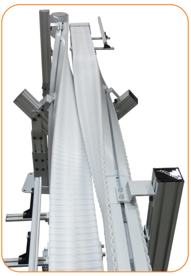
Helical Twist up to 90 Degrees