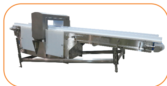
Also available on Dorner 3200 Series, AquaGuard, and AquaPruf Conveyors