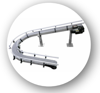
Helical Plain Bend